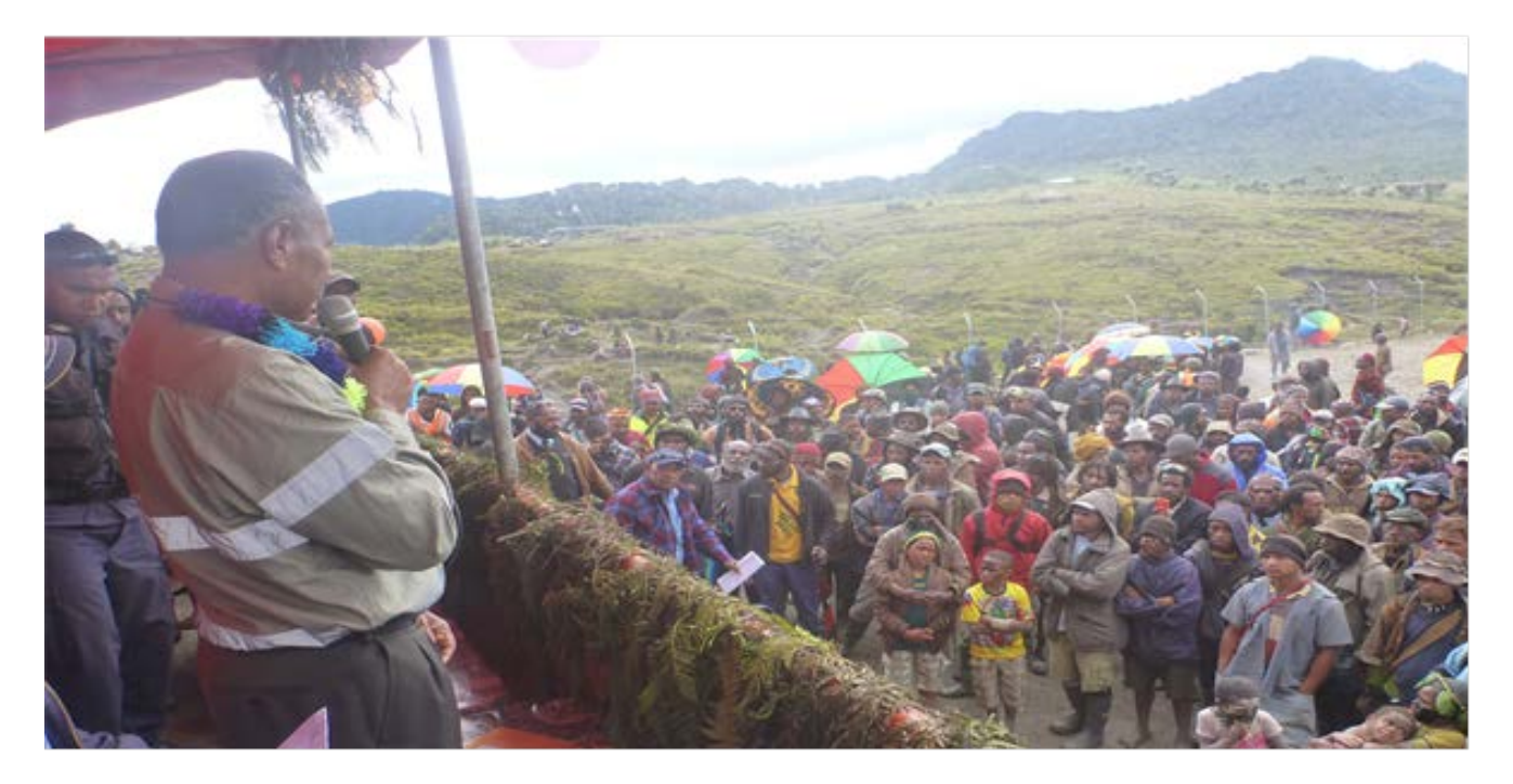
Figure 4: The Warden's Hearing at Mt Kare

The parties re-convened at Mt Kare on 17 August 2015 to complete the vetting of all clan members identified in the LIR. The mediation was successfully completed at Mt Kare on 17 August 2015 with all clans signing the Agreement in the presence of the Mediators.