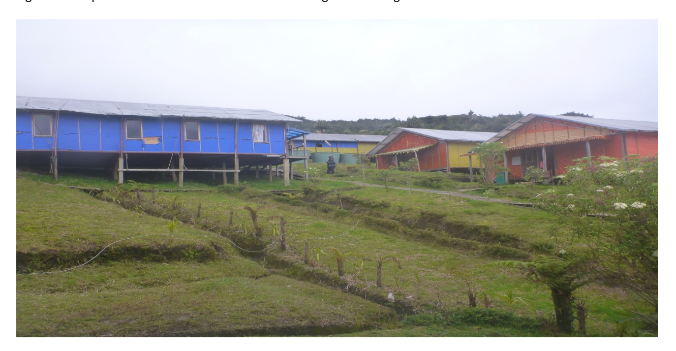
Figure 3: Camp Infrastructure at Mt Kare maintained in good standing

Funding provided by the Secured Creditor to date has enabled the Company to: