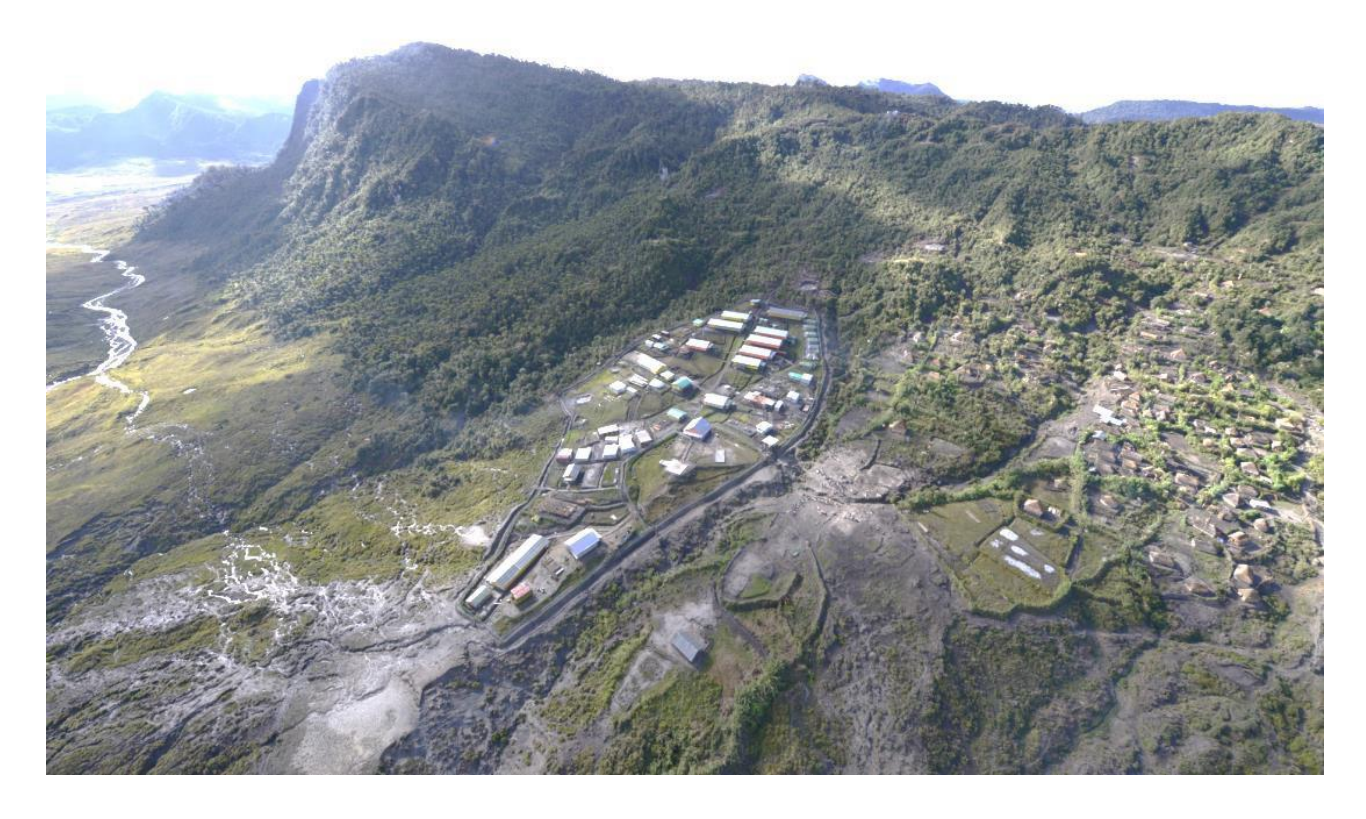
Figure 1: Mt Kare Camp

Over the past 3 years Indochine has been funded by a Secured Creditor (refer ASX announcement of 14 May 2015). This support has enabled Summit to provide site security and keep the camp and project infrastructure at Mt Kare on a care and maintenance basis whilst the Judicial Review process is completed.