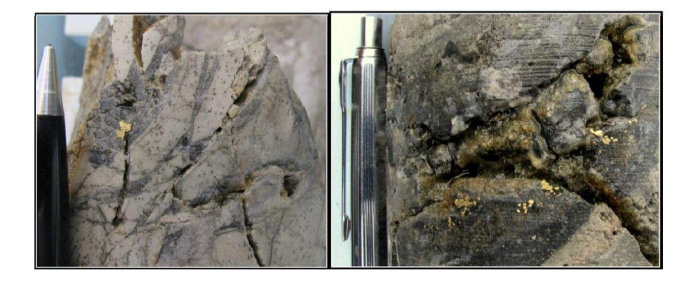
Figure 3: High Grade Gold in Core from Drill Hole 132SD12