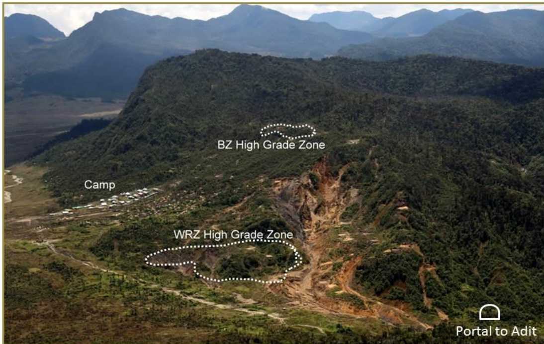
View looking south east over Mt Kare 1