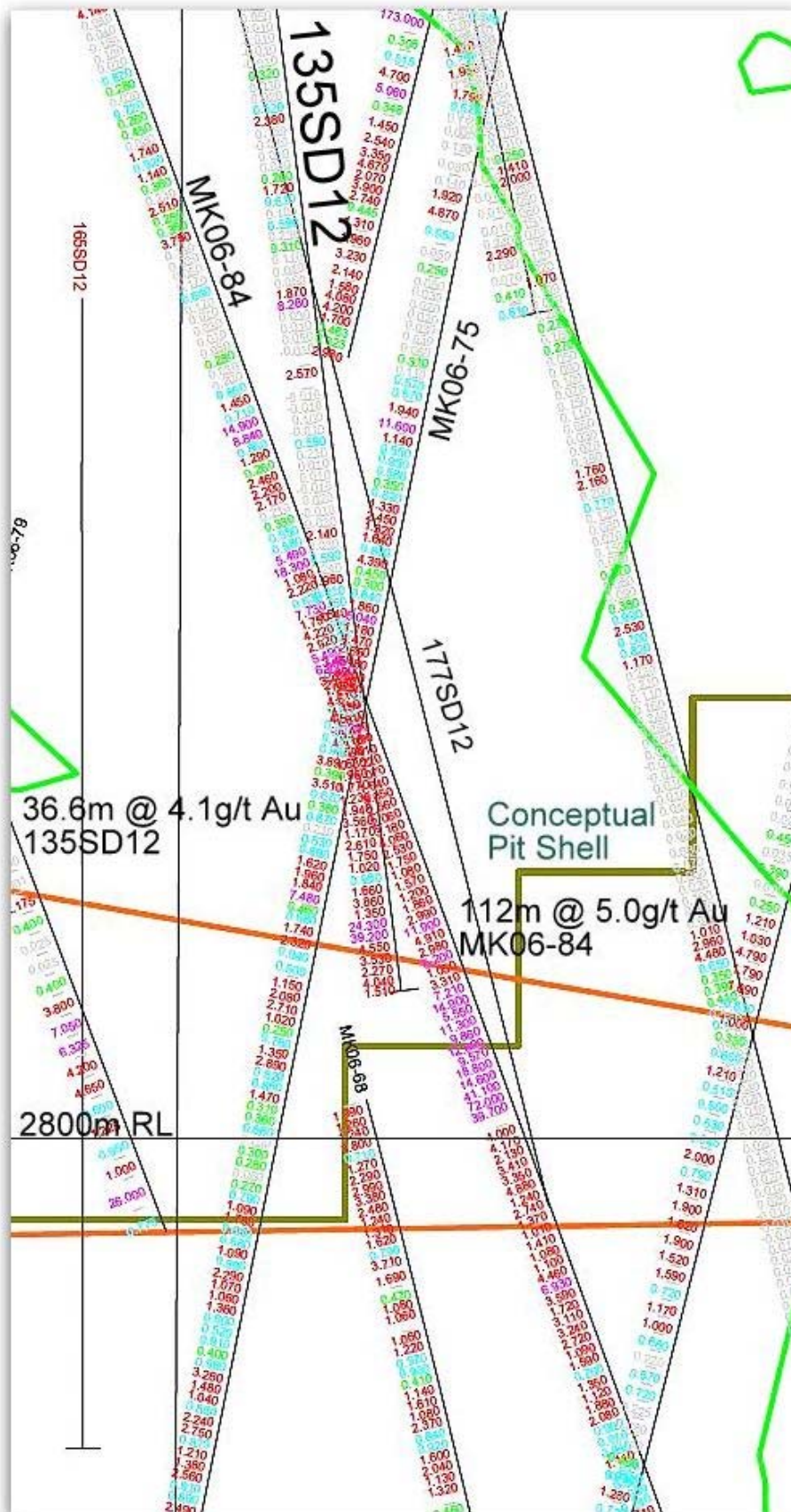
Figure 2: Detailed cross-section through the WRZ of the Mt Kare Resource showing drillhole 135SD12 and past drillholes on the same section